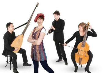
Da Vinci's Apprentice

On Monday next week we are excited to welcome back Musica Viva for a student performance called Da Vinci's Apprentice. Students will be introduced to a range of new instruments as they learn about a girl named Roberta, who dreams of becoming an apprentice to the great inventor, Leonardo Da Vinci. We would like to thank Musica Viva for providing this performance to students free of charge, as part of our three year Musica Viva Residency.